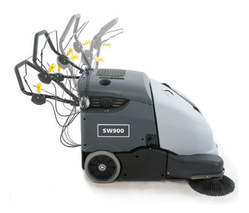
Handlebar adjusts to fit a wide range of users and folds to provide convenient transport and storage.