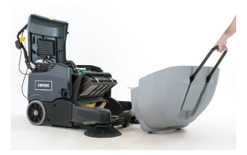
Single hand hopper removal and installation with wheels to facilitate easy transport for dumping.