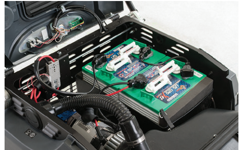
Hood opens providing full maintenance and service accessibility to the battery compartment.