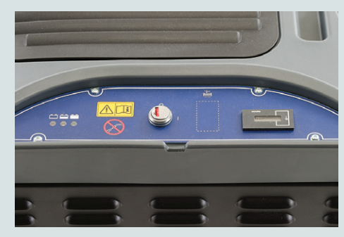
Control panel with key switch, battery charge indicator and hour meter.