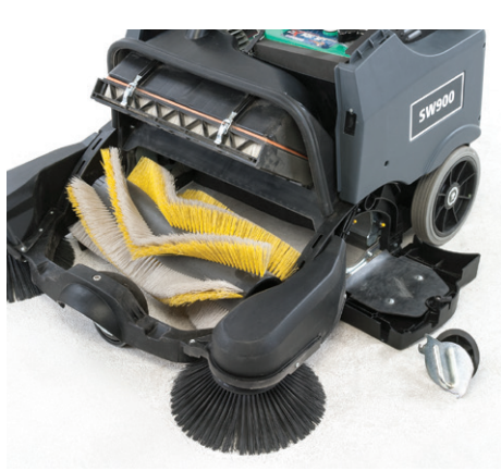
Time-saving maintenance: Broom replacement, and other routine maintenance, can be performed without tools.