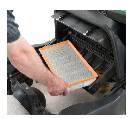
Single-stage high capacity dust control system for more effective dust control. Access filter without tools.