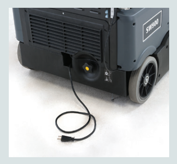
An onboard charger provides the convenience of charging anywhere a power outlet is available.