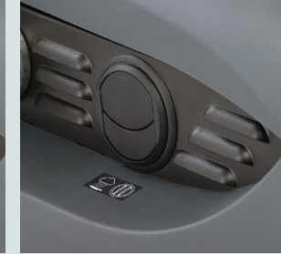
Wet sweep bypass protects the filter from water fouling when sweeping in wet conditions.