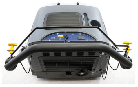
All brooms are adjustable from the operator's position.