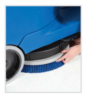
Brush Assembly Tools-free removable brushes or pads.