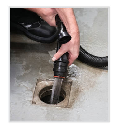
Drain Hose No-nonsense, easyflow hose makes draining the tank simple.