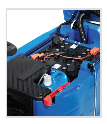
Battery Compartment The RA40™ is available with wet or AGM maintenance-free batteries.