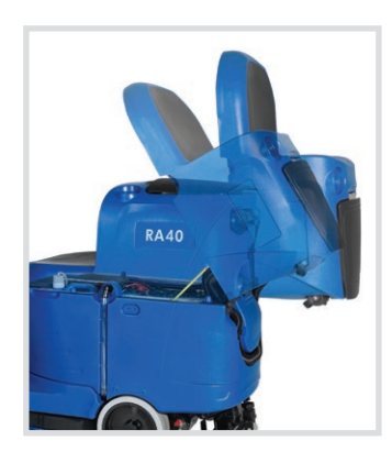
Recovery Tank Access Recovery tank fully tiltable gives easy access to battery compartment and the detergent container.