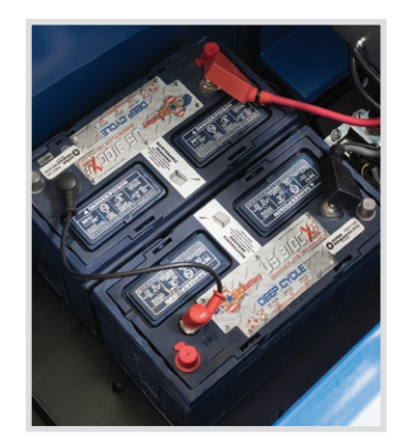
Battery Compartment The SA40<sup>™</sup> is available with wet or AGM maintenance-free batteries.