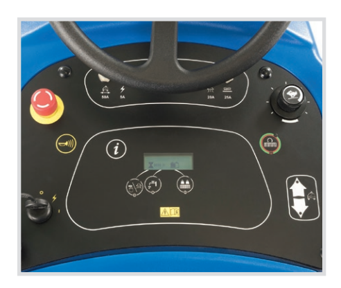
Control Panel Simple, intuitive controls minimize operator training.

With the SA40 you can enjoy a high level of cleaning performance without sacrificing sustainability. The SA40 is designed to allow you to clean with minimal consumption of detergent and water so that real savings can be gained without compromising performance or the environment. All Clarke auto scrubbers feature important benefits such as low noise levels, enhanced user ergonomics, onboard chargers and superior pickup to ensure you are left with clean, dry and safe floors.