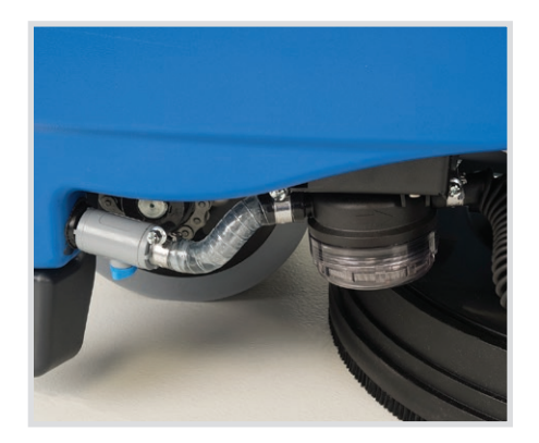
Solution Filter Externally mounted solution filter is easy to clean and minimizes exposure to chemicals.