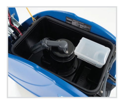
Easy Maintenance Access Flip-up lid and tilt-back tank provides easy access to the recovery tank, debris catch cage and batteries.