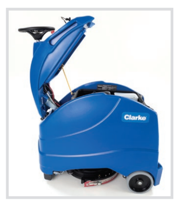
Clam Shell Design The clam shell design makes charging easy, with virtually no increase in the machine's foot print. This allows it to easily fit into a cramped janitor's closet.